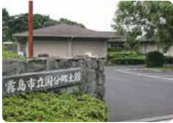
3819 Kamikogawa, kokubu, Kirishima City, Kagoshima, 899-4316