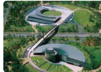
1-1, Kokubuenoharajomonomori, Kirishima City, Kagoshima, 899-4318