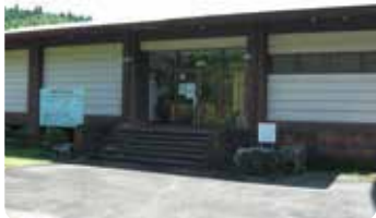
148-1 Kirishimataguchi, Kirishima City, Kagoshima, 899-4201

TEL 0995-57-0316 (Kirishima Community Center)