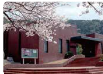
771 Fukuyama, Fukuyama-cho, Kirishima City, Kagoshima, 899-4501