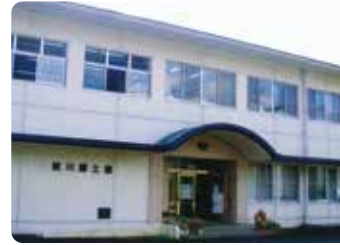
192-7 Nakano, Yokogawa-cho, Kirishima City, Kagoshima, 899-6303