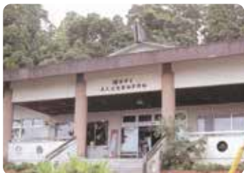
2469 Uchi, Hayato-cho, Kirishima City, Kagoshima, 899-5116