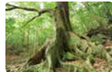
Mikyo Area (Tokunoshima Is.)