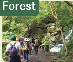
Ishago Waterfall (Amami-Oshima Is.)

In Amami's forests, roadside streams, waterfalls and unexpected encounters with unique creatures entertain the hikers. In islands with deep forests, feel the breathing of evergreen broad-leaved forests which are nominated for a World Heritage property. In flat islands, walk through the forests to reach the mountain top which offers a panoramic view.