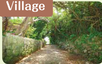
Tunnel of banyan trees (Okinoerabu Is.)

The Amami Trail goes through many villages, where you can interact with the locals and observe the wisdom and culture developed by their interaction with nature. You can also participate in guided tours organized by the locals.