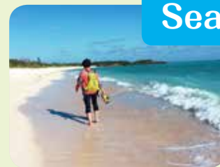
Oganeku Coast (Yoron Is.)