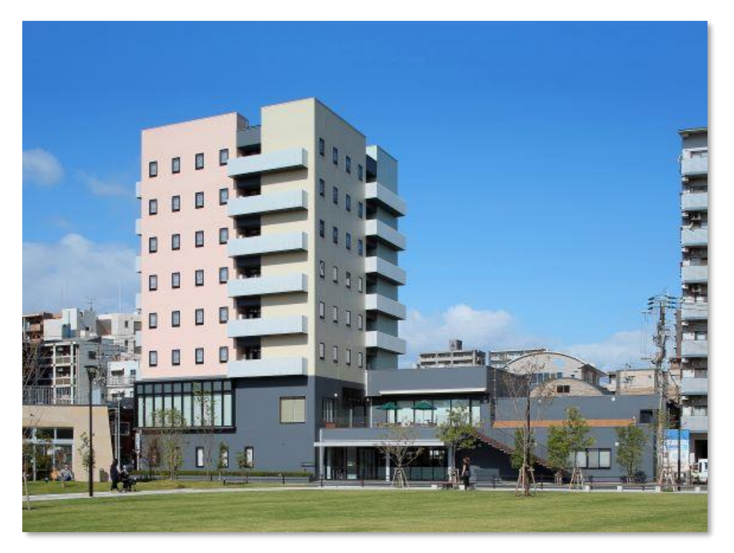
International Friendship Center Kagoshima (From Kajiyamachinomori Park)

In that building, there are dormitories for foreign students (administered by Kagoshima Prefectural Government) and exchange facilities (administered by Kagoshima City Government) which citizens can use. It is a place where you can enjoy international exchanges by just coming.