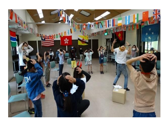
4/25 The First English Challenge