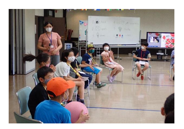
7/11 The Second English Challenge

Since 2020, foreign language activities has been compulsory for elementary school students who are of third grade and above, and learning English has been becoming increasingly important. In this context, KAPIC Center is holding English events for elementary school students together with Assistant Language Teachers (ALTs) in the Osumi Peninsula. We believe that we can contribute to the development of cosmopolitan human talents by having fun with using English from the early stages of life in elementary school and having an enjoyable time interacting with foreign teachers.