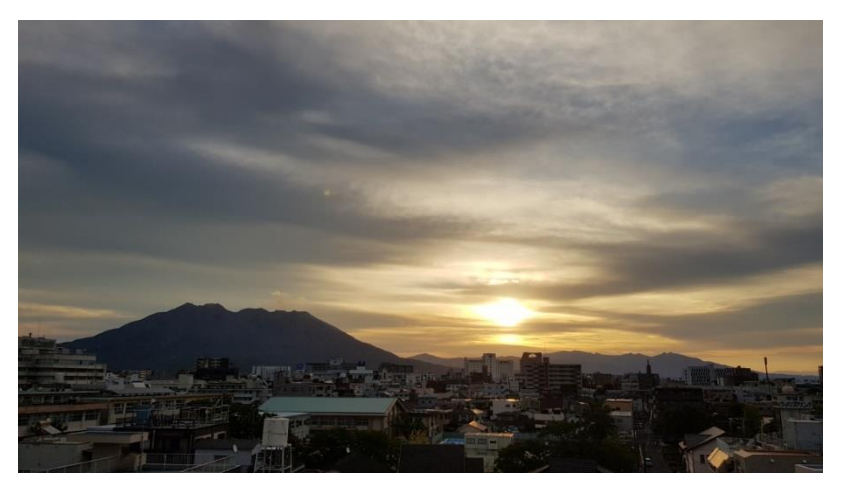
Sunrise over Sakurajima

I have only been here for 3 weeks, but during the bustle of settling down I was able to experience the warm hospitality of the people here and I am really grateful for it. Being a naturally shy person who is insecure in my Japanese, this is a big step out of my comfort zone. However, I am learning and adapting fast thanks to the kind patience of everyone around, while enjoying each step of the process along the way.