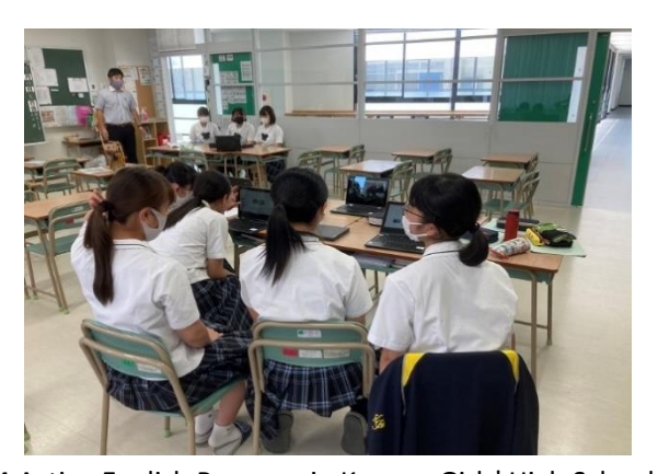
7/14 Active English Program in Kanoya Girls' High School