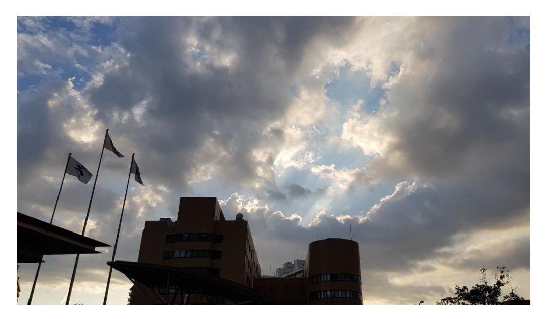
Sunset sky near the Prefectural Office

I have barely been here for less than a month and the future stretches out ahead, bright and full of potential. As a newcomer, there are many things which I am still learning but I will do my very best. Again, I really appreciate all the gracious support of everyone around and I look forward to your kind guidance!