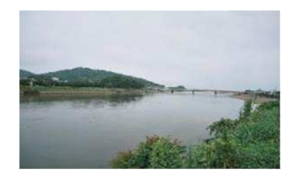
Ogawa River opposite the tree

Over the years, the surrounding landscape has changed but the great camphor tree still stands as a nod to the history of this area. Today, instead of trading ships plying this same Ogawa River, there will be dragon boat races held during the annual Nejime Dragon Boat Festival.