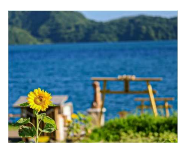
Sunflower basking in the sun