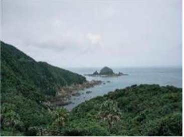
Pathway down towards the cape and the accompanying views