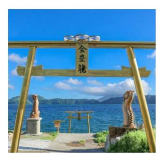
Golden Torii Gates

Please aim your offering money towards the golden baskets on top of the torii gates!