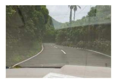
The tropical-looking view along the drive down to Cape Sata

The route down is lined by subtropical and tropical plants such as Chinese fan palms and cycads, and has the sparkling blue ocean on one side. Coming from a tropical country, parts of this road gave me an unexpected nostalgic feeling, almost if I was back home.