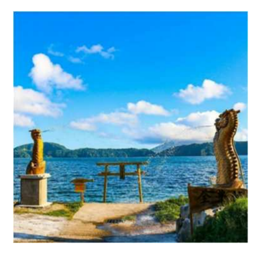
Water spouting from the dragon's mouth!

This is a recommended spot for the upcoming seasons!