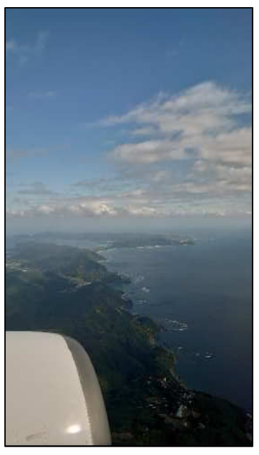
Amami Oshima comes into view!

said to be one of the world's three great fabrics, Amami Oshima has unique ecosystems and biodiversity, and was registered as a UNESCO World Natural Heritage Site in 2021 along with Tokunoshima, the northern part of Okinawa Island, and Iriomote Island. In December 2022 I had the chance to visit Amami Oshima, and was able to experience the island's charms for myself. In this column, I introduce my impressions of the sites I visited.