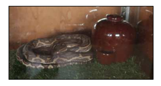
The habu, guardian of the forest

In fact, it wasn't only Hara-san who held this view – many of the island residents I spoke to felt the same way. While acknowledging that they are, of course, dangerous animals, the people of Amami Oshima see habu as an important protector of the island ecosystem, and have a deep respect for them.