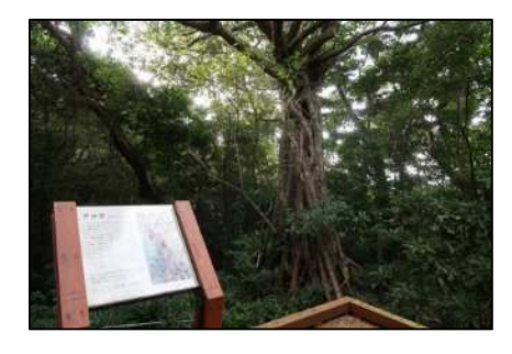
A 'strangler' fig tree