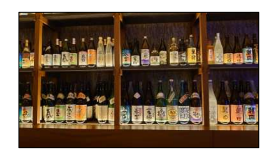
Bottles of kokuto shochu

I ate many island foods, including chomeiso (Peucedanum japonicum) tempura and abura-somen (stir-fried somen noodles), and just like the food on