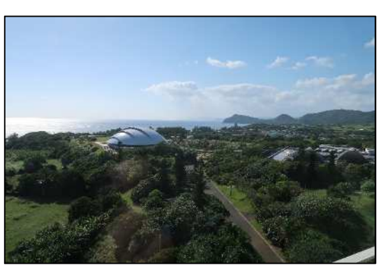
The observation deck at Amami Park

You can't miss the Tanaka Isson Memorial Museum of Art, also located within the park. After moving to the island in his fifties, Tanaka Isson used his unique artistic style to portray many of the birds said to represent Amami Oshima, such as the ruddy kingfisher. The museum holds over 400 of his works, and the displays are changed seasonally.