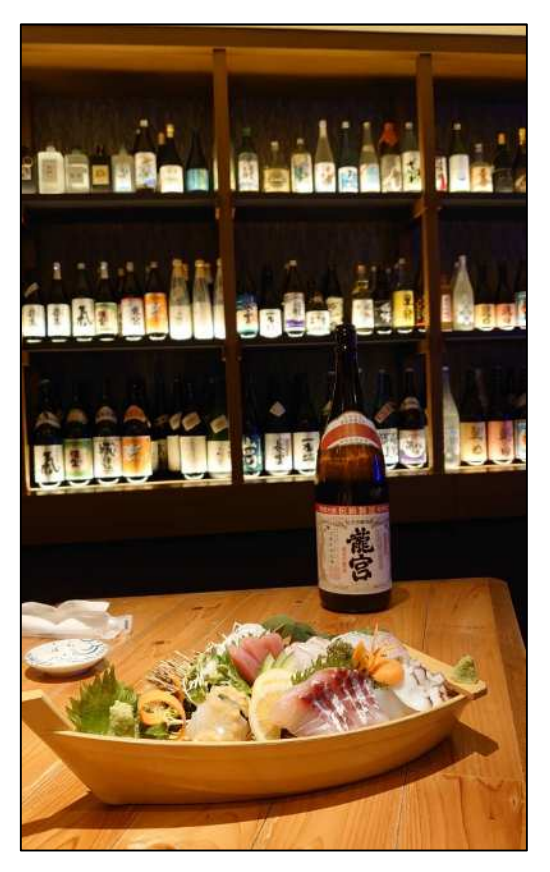
A wonderful night of food and drink!

(That's all for this time! Find part two of this column in issue 176.)