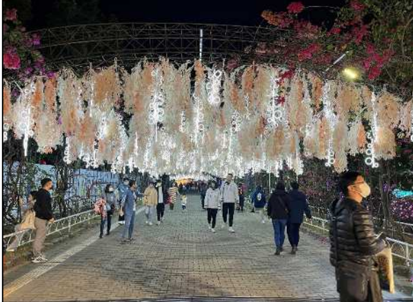
Left: The Kagoshima Booth / Right: Illuminations at the venue