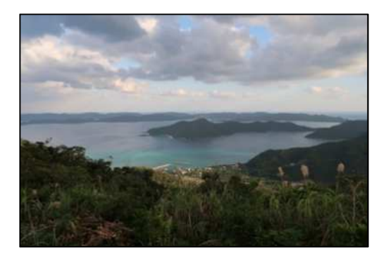
The view from the observation deck

Indeed, thanks to my guide, I could hear the calls of wild birds, see the mysterious form of the sea fig tree (also known as the "strangler tree"), and even taste the fallen fruit of the chinquapin. Finally, I made my way to the observation deck, where a stunning view was waiting for me. The path to the observation deck is barrier-free, so it's a place that everyone can enjoy.