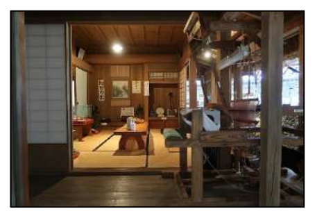
The General Exhibition Hall