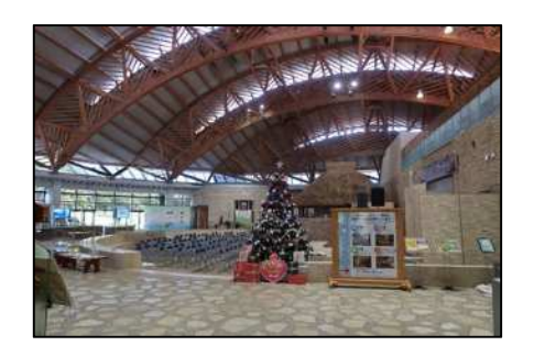
The Event Plaza