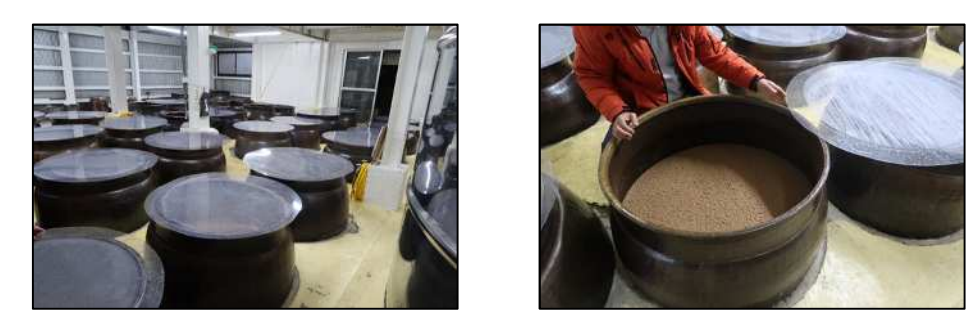
Tanks containing moromi (ferment)

I found Tomita-san's tour deeply interesting, even more so because I could compare what I was seeing with the imo-jochu (sweet potato shochu) distilleries that I had previously visited on Kagoshima's mainland. There were a number of differences – for example, in the production of shochu there is a fermentation process known as shikomi , which results in the creation of moromi , the ferment. During the process, raw materials are mixed in tanks buried in the floor, but since the climate on Amami Oshima is warmer than on the mainland, only the bottom parts of them are buried here!