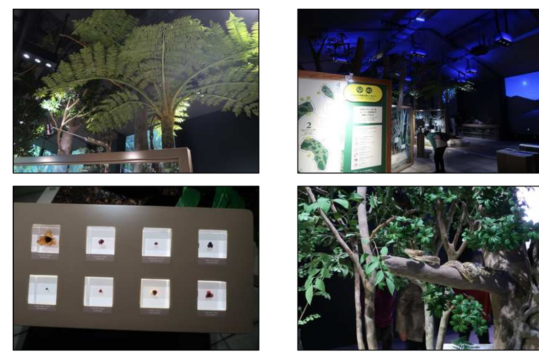
Inside the exhibition space

features of the island's nature, I found myself amazed again and again by the process of evolution.