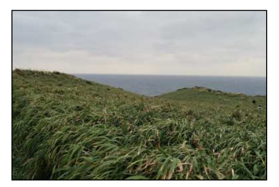
Cape Miyakozaki, covered in ryukyusasa!