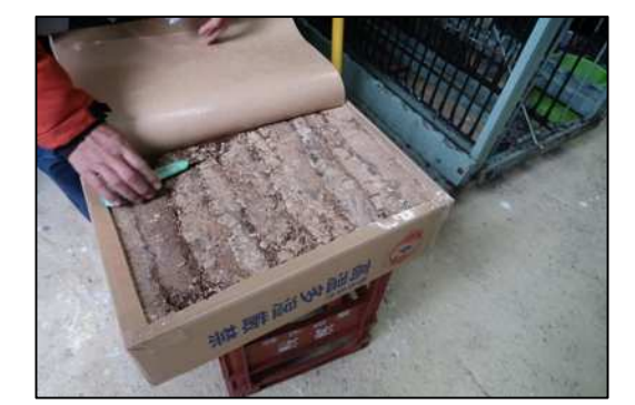
Okinawan brown sugar used at Tomita Shochu Distillery

It's all about the "Wind Taste". In other words, sugar cane (which is used to make brown sugar) is buffeted by the sea breeze as it grows, and this affects the flavour. Since sugar cane plants cultivated in different locations have different degrees of exposure to the sea breeze, the flavour of the sugar (its "Wind Taste") also differs. At Tomita Shochu Distillery, "Ryugu" is made from Okinawan brown sugar, but "Maaran-sen" uses Amami brown sugar, so I recommend trying both!