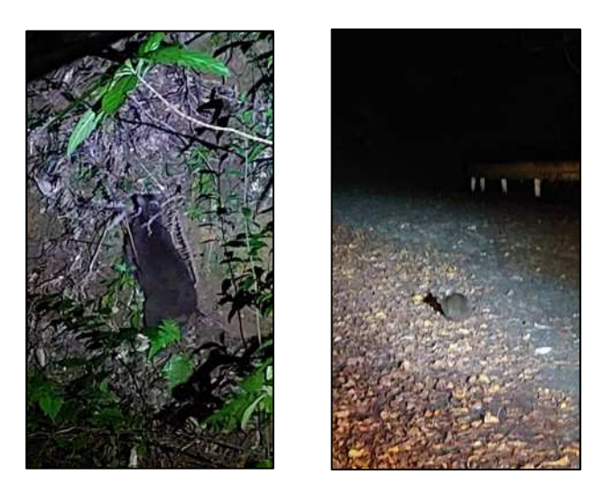
Catching sight of an Amami rabbit on the Santaro Pass

On my second evening, I headed to the centre of the island, traversing the Santaro Pass in order to catch sight of the Amami rabbit ( amami-no-kuro usagi ), an endangered species. Since the rabbits sometimes come out into the middle of the road, there is a limit on the number of cars that can use the pass to prevent accidents, so booking in advance is essential. As an experience you really can't have anywhere else in the world, I wholeheartedly recommend it!