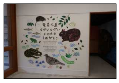
Mural by Miroco Machiko

The Amami-Oshima World Heritage Conservation Center