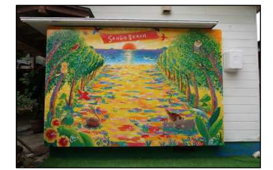
The area is also full of Instagrammable spots and remnants of Ryukyu culture!

The Fukugi Namiki, rows of fukugi trees that create tunnel-like streets, directly face the beach. Since fukugi trees are able to grow perfectly well in close proximity to each other, it's possible to create living walls by planting them together in rows! They were originally planted to shield against the wind and prevent the spread of fire,