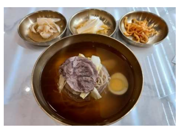
This Pyongyang-style naengmyeon , prepared by a famous Pyongyang-born chef, tasted absolutely divine!

Korean naengmyeon is said to have originated from the cities of Pyongyang Hamhung in North Korea. and Pyongyang-style naengmyeon known as mul-naengmyeon and uses noodles made from buckwheat and a small amount of starch, served in pheasant broth with daikon radish and radish kimchi, with toppings such as meat, pear and boiled egg. On the other hand, Hamhung-style