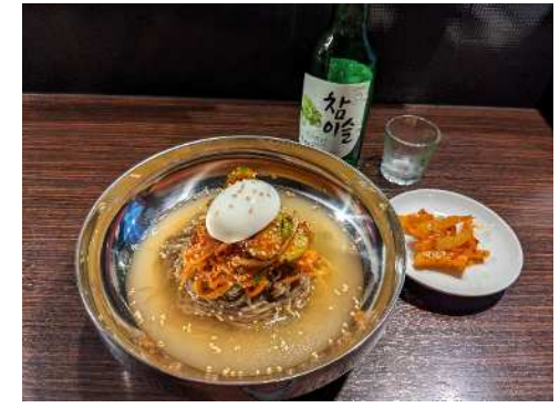
Hamhung-style naengmyeon served here in Kagoshima City!

In fact, Korean people may even group themselves into those that prefer the clean bite of the buckwheat flour-based noodles and the refreshing cold soup of Pyongyangstyle naengmyeon, and those that favor the firm texture of the starch-based noodles and the spicy zing of Hamhung-style naengmyeon!