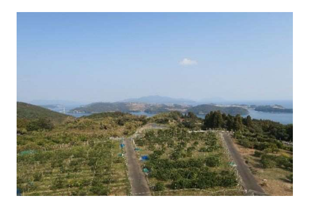
The view from the future co-working space

Contrasting with the retro feel of the rest of the facility, the top floors are being transformed into a modern and stylish coworking space, along with a study space for local students. Overlooking the orange groves, you couldn't ask for a more idyllic location for a 'workcation'. Mr Yamagami is keen for the centre to serve as a hub for exchange with the international community of citrus growers and