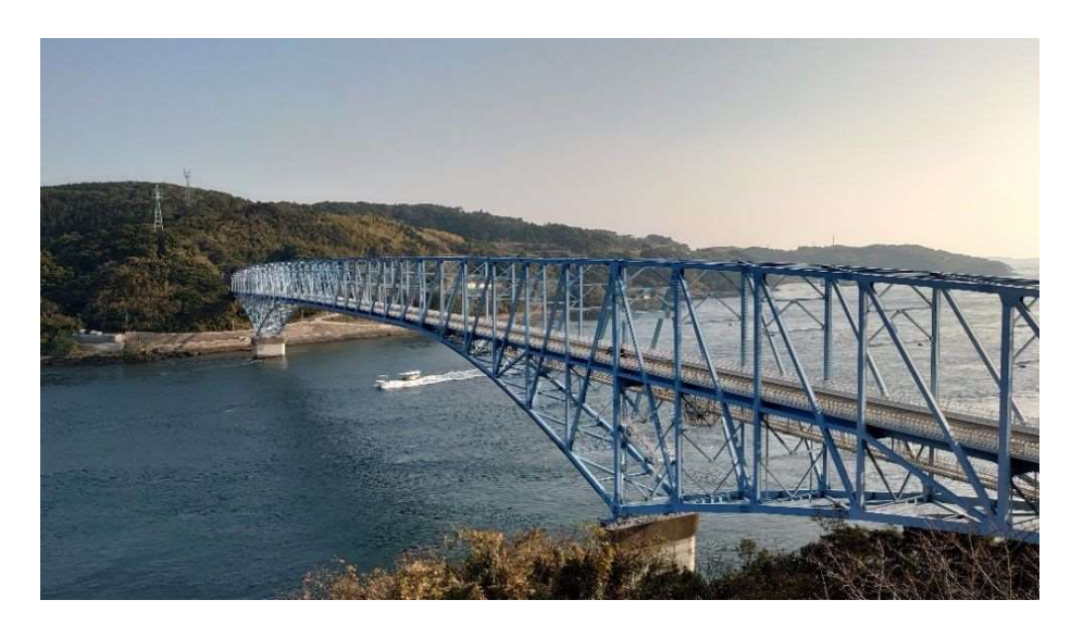
The Kuronoseto Ohashi Bridge

I take a fresh Satsuma mandarin out of my bag. Somehow, I think this one will taste even sweeter than I remember.