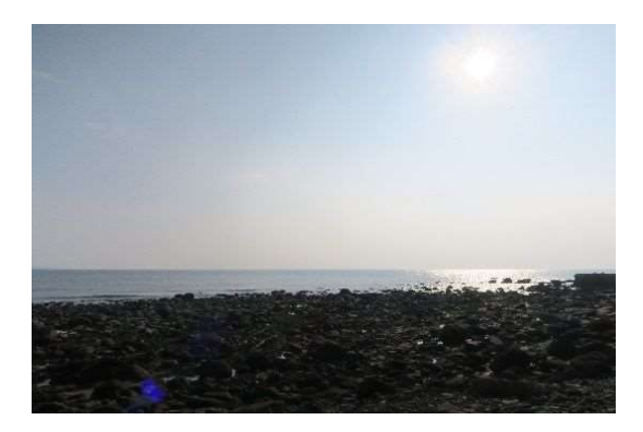
The beach behind the memorial stone

The monument is itself impressive, with an air of solemnity around it, but just behind the memorial stone is a humble, pebble-covered beach. Standing by the waves, facing outwards towards China, I took a moment to imagine what it would have been like to be here on that fateful day in 778.