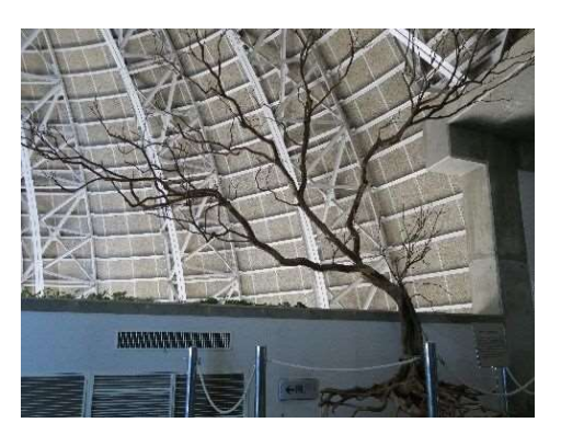
Second generation Satsuma mandarin tree

Personally, my favourite part was the second floor, which houses the remains of an authentic second-generation Satsuma mandarin tree, thought to have begun its life around 100 years ago. Next to that is a treasure trove of information, including a collection of mandarin tree cultivation logbooks written by hand many decades ago. Even as someone without any specialist knowledge, I would love to spend an afternoon poring over the contents of those books.