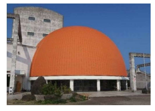
The orange dome of the Japan Mandarin Centre

Heading north, we continued our journey to our first destination. The Japan Mandarin Centre was opened in 1993 as a facility for visitors to learn about the history and culture behind mandarin orange cultivation. It sits off the beaten tourist track, but the building is unmistakable, crowned with a huge, orange, mandarin-shaped dome.