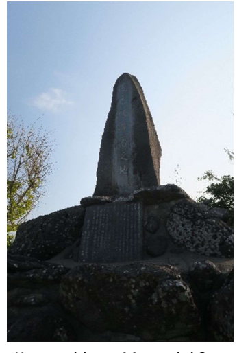
The Kentoushi-sen Memorial Stone

Given that Nagashima is the top production centre for yellowtail in all of Japan, I went for the Yellowtail King Set Meal ( Buri-ou Teishoku ), the most popular dish. With the fish served in several different forms, and topped off with a mandarin-flavoured dessert, I certainly wasn't disappointed.