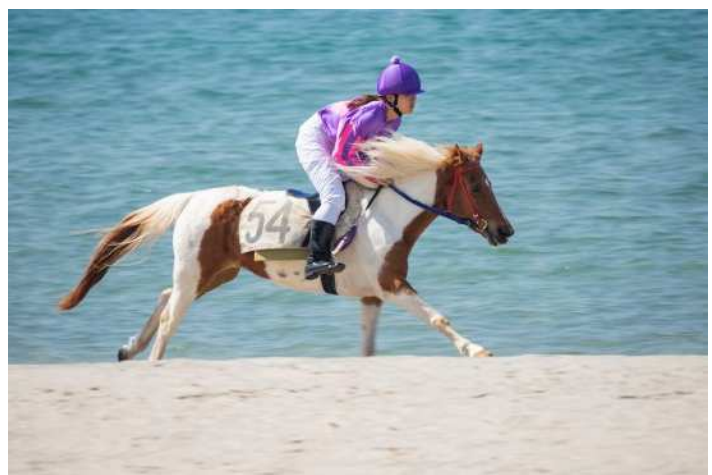
▲Horse racing▲