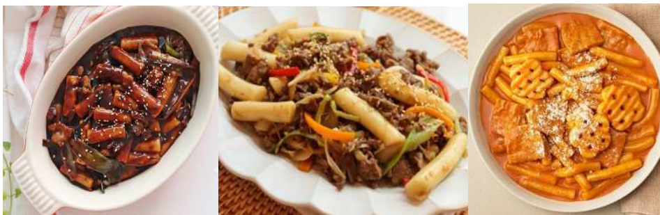
▲From left-to-right, zhajiangmian flavour, royal court flavour and rosé flavour

The bright red Tteokbokki does look very spicy, and be under no illusion: it is. However, there are non-spicy toppings that you can add. There's the soy sauce-