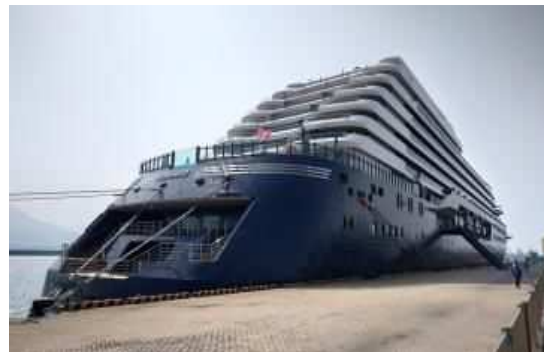
▲Luminara cruise ship