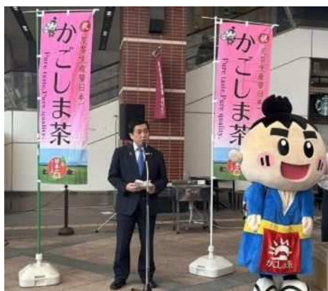
▲At the ceremony

I attended the ceremony in Amu Square, Kagoshima Chuo station celebrating Kagoshima being the number one producer of crude tea in 2024. The event, held by the Tea Industry Chamber of Kagoshima, had very popular tea-tastings and tea stalls run by different tea producers from across the prefecture. In my remarks to the ceremony, I thanked Kagoshima's tea industry for their tireless work over many years to keep Kagoshima's record of being number one in crude tea production for two years running. I hope that Kagoshima Tea will continue to build a great name for itself and that as Japan's number one tea region, we will continue to see further development in our tea industries.