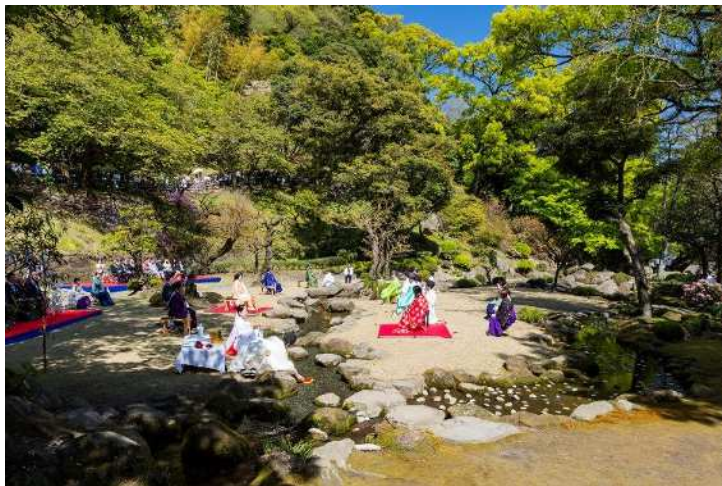
▲Kyokusui-en ▶