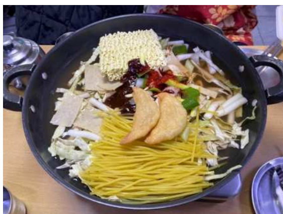
▲Pre-seasoning impromptu Tteokbokki

In Seoul's Sindang-dong, you can find a variety of impromptu Tteokbokki shops. With this type of Tteokbokki, you put the ingredients in the pan and can adjust the seasoning to create a flavour unique to your table. It's lovely to eat once you've finished making it; however, I really enjoying eating as I go, which I strongly recommend to Tteokbokki fans.