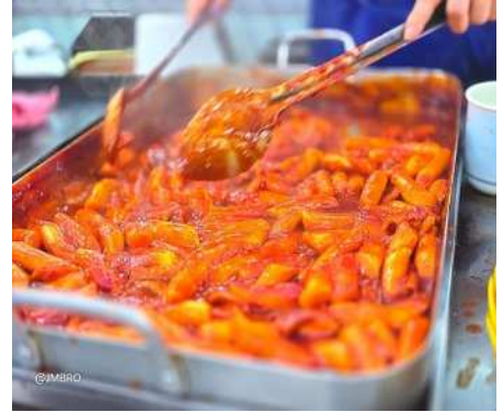
▲Tteokbokki on sale in a market

Do you know the favourite food of Korean high school girls? It's Tteokbokki! The symbolic Korean food is popular among women, particularly high schoolers. I also happen to love it! When you want to go out for delicious food with your friends, treat yourself after an exam, or just want a delicious spicy treat, Tteokbokki is your go-to.