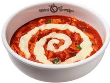
▲Famous very spicy Tteokbokki

that you can use ingredients of your choice to create a flavour of your own. Its particularly unique as you can just keep adding toppings. You could, for example, add ramen, udon, harusame noodles, boiled eggs, weiners and more, to make it even more delicious. It is very common to add vegetables such as cabbage and spring onion; however, given the strength of flavour of the dish, no matter what vegetable you put in, it doesn't make much of a dent on the flavour. Given this, it's a perfect dish for using up the leftover vegetables in your fridge.