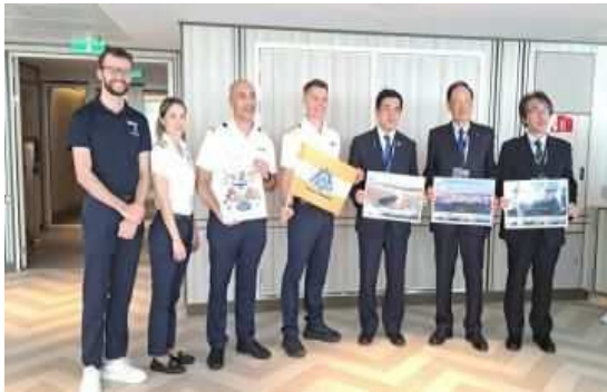
▲With staff of the Luminara

I welcomed the Luminara on its first port call at the Kitafuto pier in Kagoshima Port and delivered a speech on behalf of Kagoshima Prefecture. I extended my gratitude to the cruise company for making a port call in Kagoshima Port and conveyed my hope that those on board will be able to fully enjoy Kagoshima, the Treasure of the South, with our prefecture's stunning scenery, food, culture and history. We had a positive discussion on plans to continue making port calls and to use prefectural produce on-board. Next month, the Luminara will be making a call at Naze Port. Going forward I will continue to work to spread the economic benefits of continued and increasing port calls to this prefecture.