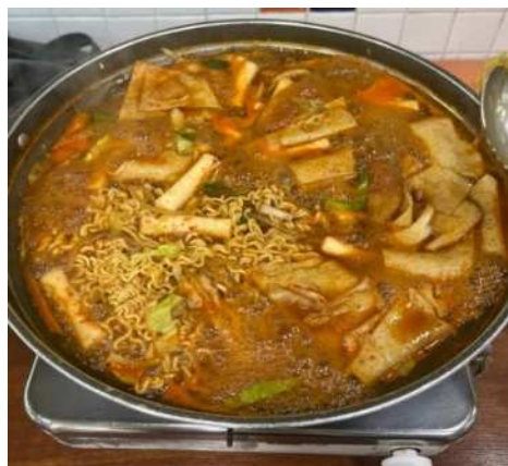
▲Post-seasoning impromptu Tteokbokki

Now that you've read this, I am sure that you want to go and try Tteokbokki for yourself. Most Korean establishments in the prefecture serve Tteokbokki, so why not try it for dinner this evening? Otherwise, given how easy it is to make, why not try making it at home as well?