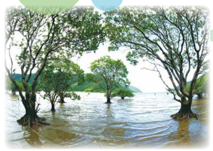
Mangrove forest in Sumivo Town (Amami-Oshima Is.)