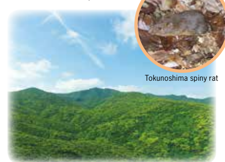
Mt.Yuwandake (Amami-Oshima Is.)

Many of the creatures of Amami cannot be seen easily, however, certified guides would help you discover them to fully enjoy Amami's forests.