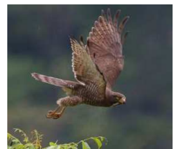
▲ A grey-faced buzzard