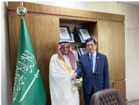
▲ With Deputy Minister for Agriculture Suliman Al-Khateeb

The meeting gave us a clear sense of Saudi Arabia's expectations for strengthening cooperation with Japan in the fields of agriculture, forestry, and fisheries.