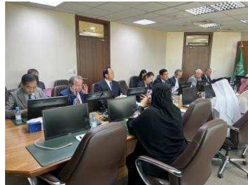
▲ Exchange of views at the Ministry of Environment, Water and Agriculture