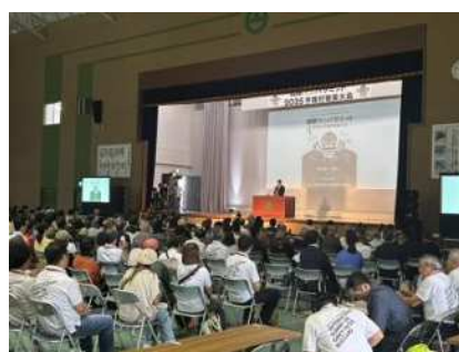
▲ Scene from the summit venue