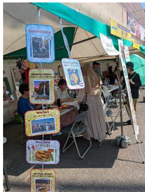
▲ Scene from the venue ▲