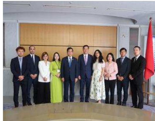
▲Commemorative photo with members of the Embassy of Viet Nam