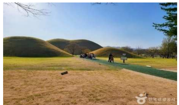
▲ Panoramic view of Daereungwon