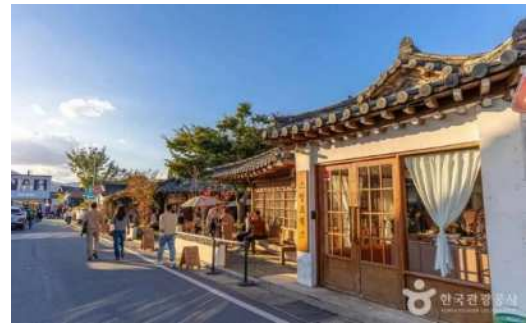
▲ Hwangnidan-gil Street View

Why not make Gyeongju your next destination in Korea?