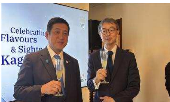
▲Commemorative photo with Consul-General Jun Imanishi

The strong interest shown by attendees toward our prefectural products reaffirmed the strong potential of our prefectural products in the local market.