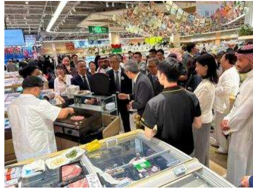
▲Venue scene (live wagyu tasting)