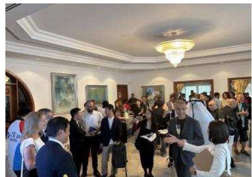
▲Scene from the PR reception venue