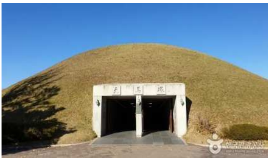
▲ Entrance to Cheonmachong

The most famous among them is Cheonmachong (the Heavenly Horse Tomb), where a gold crown and many other artifacts were unearthed,