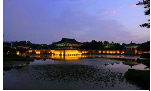
▲ Donggung Palace and Wolji Pond Illuminated at Night

As a spot where history and nature blend harmoniously, it is cherished by many visitors.