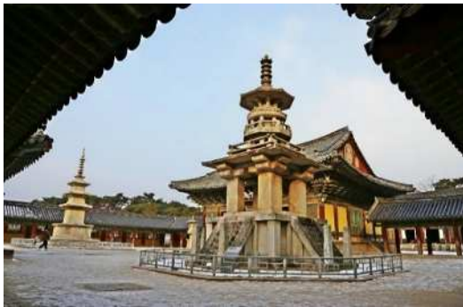
▲ Dabotap Pagoda at Bulguksa Temple

Bulguksa Temple is a representative Buddhist temple from the Silla period, renowned for its beautiful architecture and intricate Buddhist carvings.