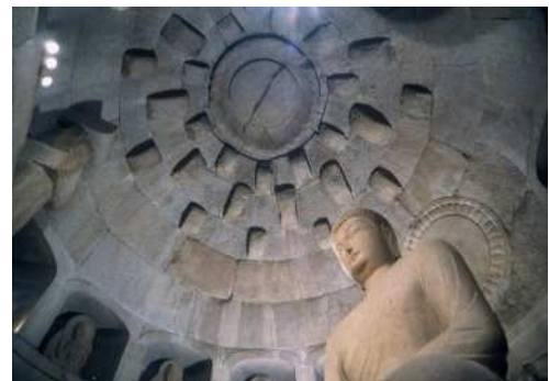
▲ Main Buddha Statue of Seokguram

It is a place where visitors can experience tranquility within a peaceful and solemn atmosphere.